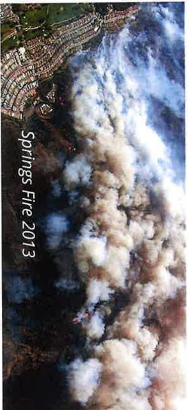
Springs Fire 2013