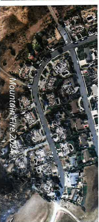
Mountain Fire 2024