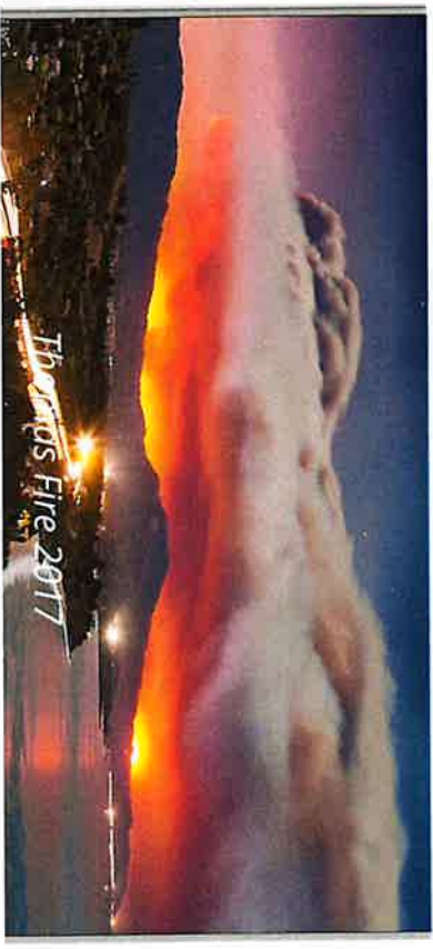
Thomads Fire 2017