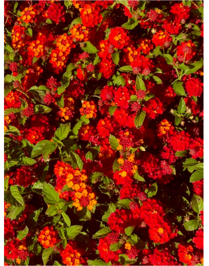
Lantana in Oak Park Residential Gardens